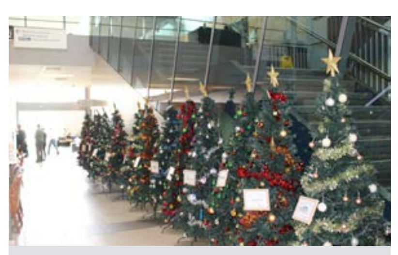
Supporting the Wellington Children's Hospital to light up the festive season for all their patients and families.

provided to New Zealand patient organisations to support numerous programs in the last 3 years.